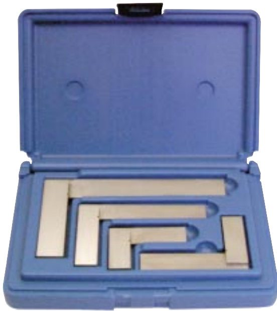
▲ Steel Square Set #52-432-246