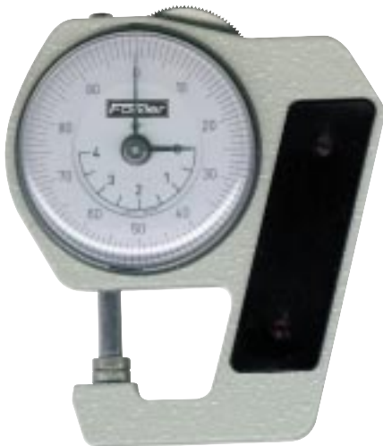
▲ Thickness Gage #52-546-000 Made in Germany