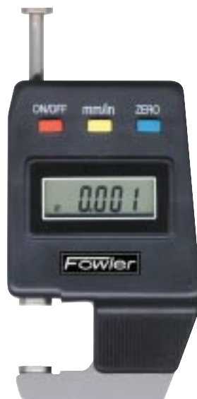
▲ Electronic Digital Thickness Gage #54-550-500