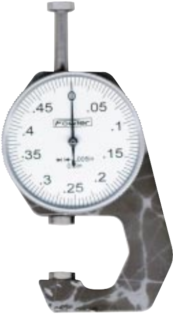
▲ Dial Thickness Gage #52-545-777