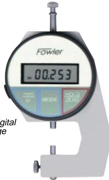
▲ Electronic Digital Thickness Gage #54-550-777