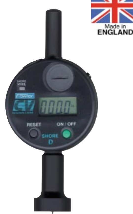
▲ #54-762 Series

Fowler's Portable Durometers are just right for testing the hardness of flexible materials such as rubber and plastics. These gages conform to shore scales.