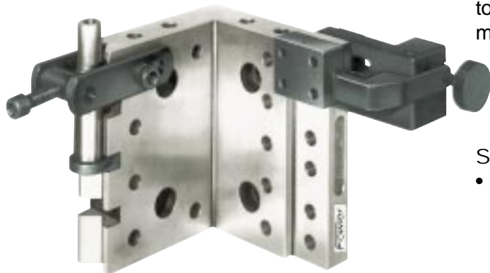
▲ #57-470-445 w/yoke & side clamp.

Twenty-five \frac{5}{16} "-18 tapped holes allow three optional clamping accessories to be bolted on in various configurations. Four \frac{3}{8} " counterbore holes allow this angle plate to be bolted to a machine or machining accessories.