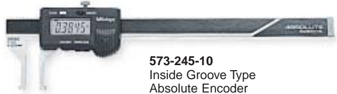
573-245-10 Inside Groove Type Absolute Encoder Digimatic Caliper