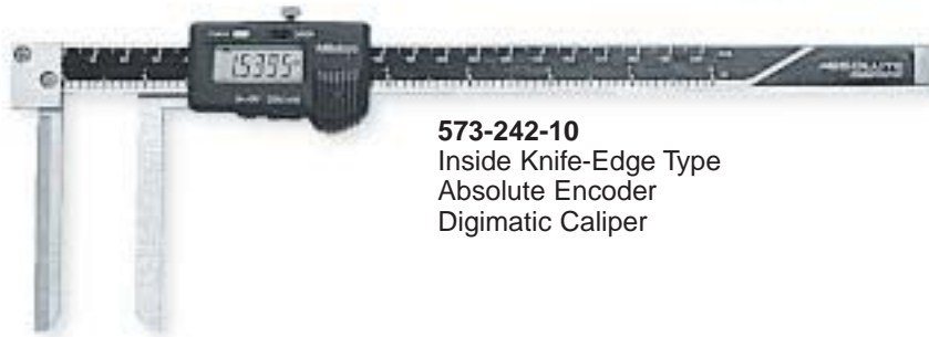
573-242-10 Inside Knife-Edge Type Absolute Encoder Digimatic Caliper