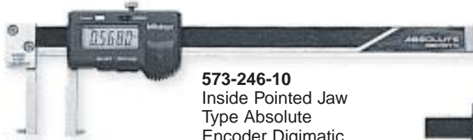
573-246-10 Inside Pointed Jaw Type Absolute Encoder Digimatic Caliper